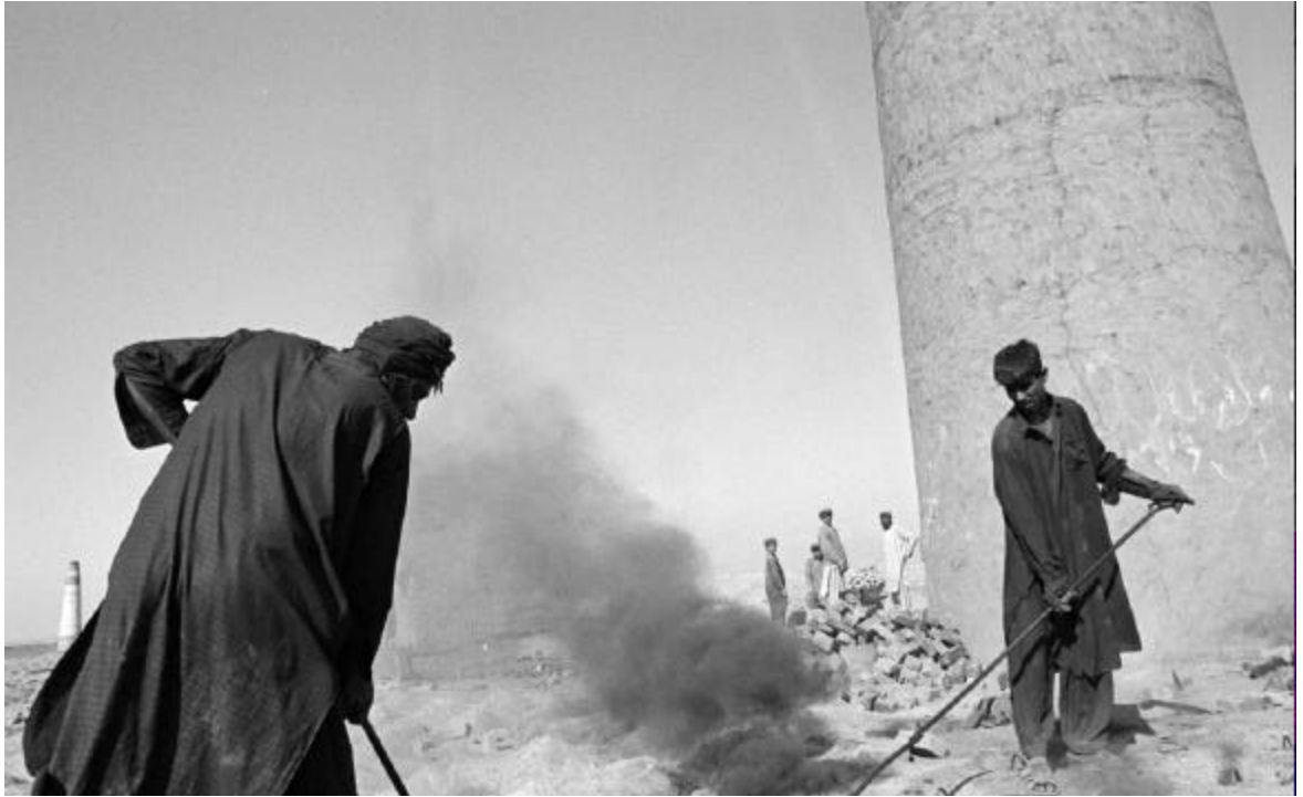
Afghani refugees working at a brick factory (the figure in the foreground is a former high-ranking army officer). Charat Camp. Peshawar, Pakistan. February, 2002.