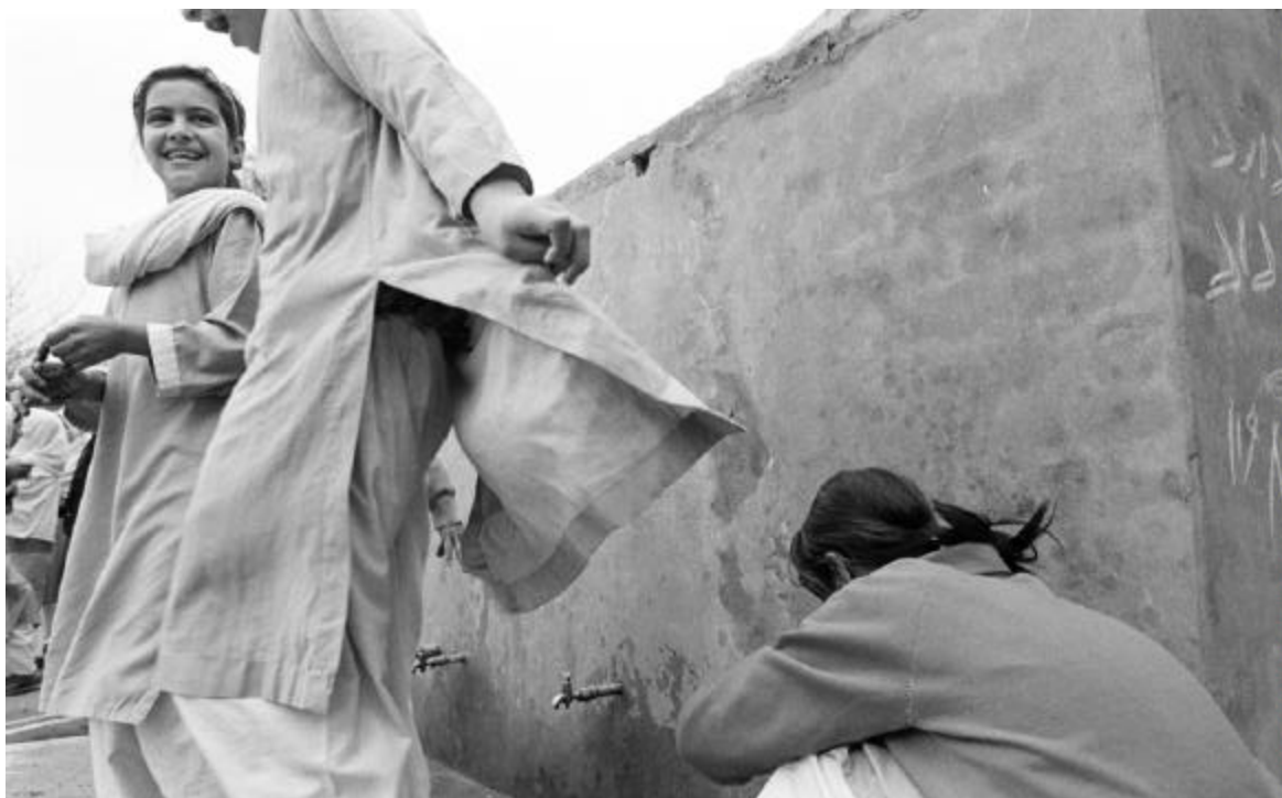
Girls at a school set up for orphaned children by Revolutionary Association of Women of Afghanistan (RAWA). Peshawar, Pakistan. February, 2002.