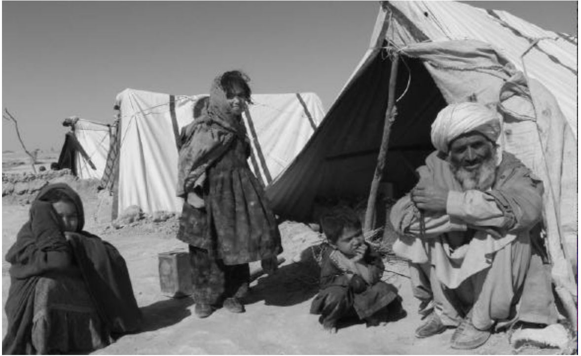
Living conditions in an "IDP" camp. Near Zaranj. March 13, 2002.