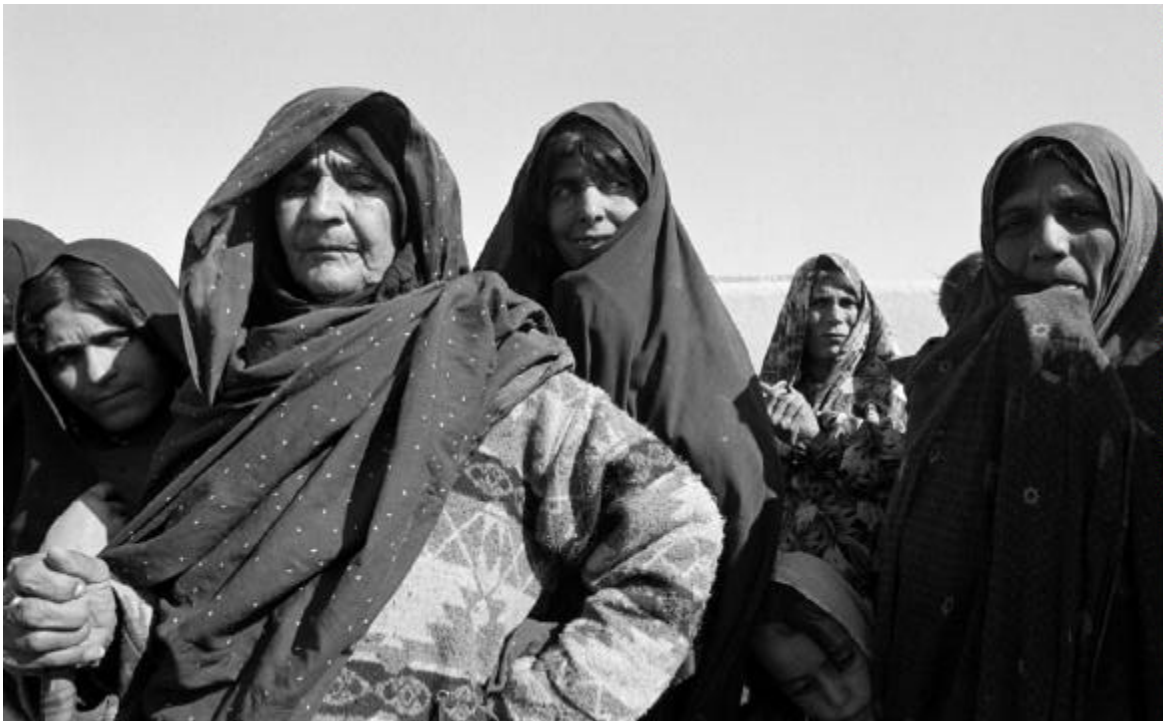
Refugees from an "IDP" camp standing in line at Médecins du Monde's clinic. Refugees trapped inside the borders of their country are labeled "Internally Displaced Persons" by the United Nations. Zaranj, March, 2002.