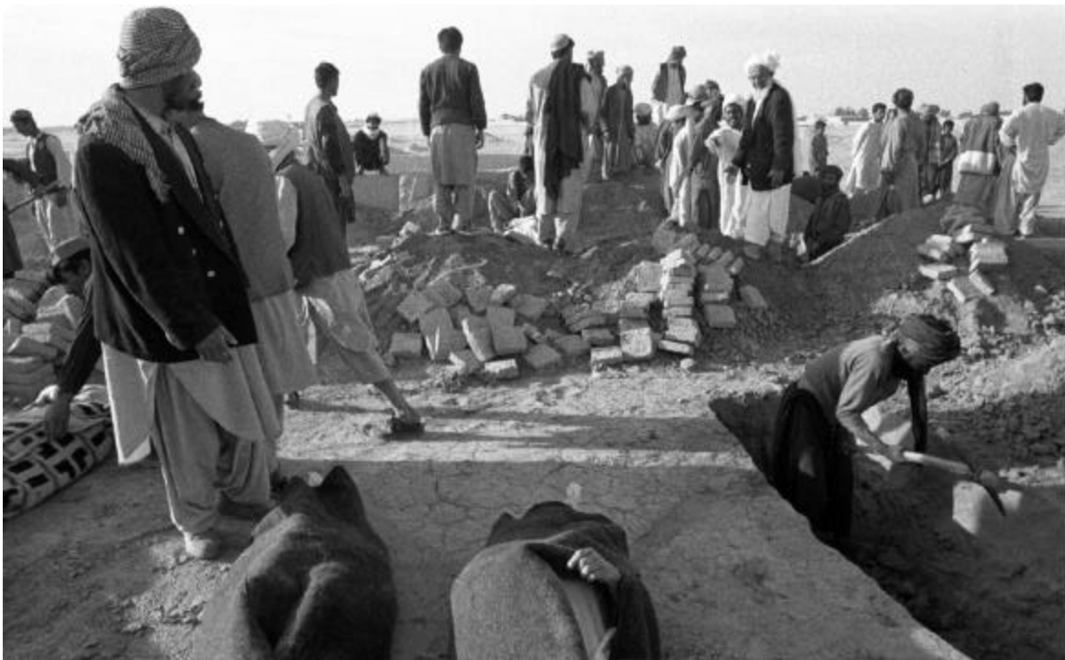
Burial of the group of refugees found "mysteriously" dead near the border to Iran. Zaranj Cemetery. March 17, 2002.