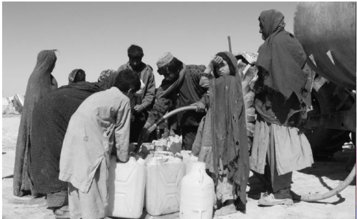
Water delivery by Médecins sans Frontières in an "IDP" camp. Near Zaranj. March 13, 2002..