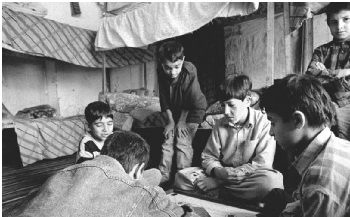
Boy's Dormitory at the school run by RAWA. Peshawar, Pakistan. February, 2002.