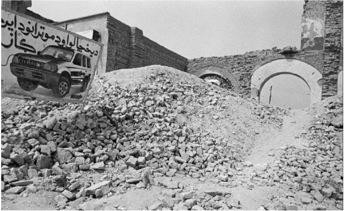
A billboard advertisement. Khandehar. April, 2002.