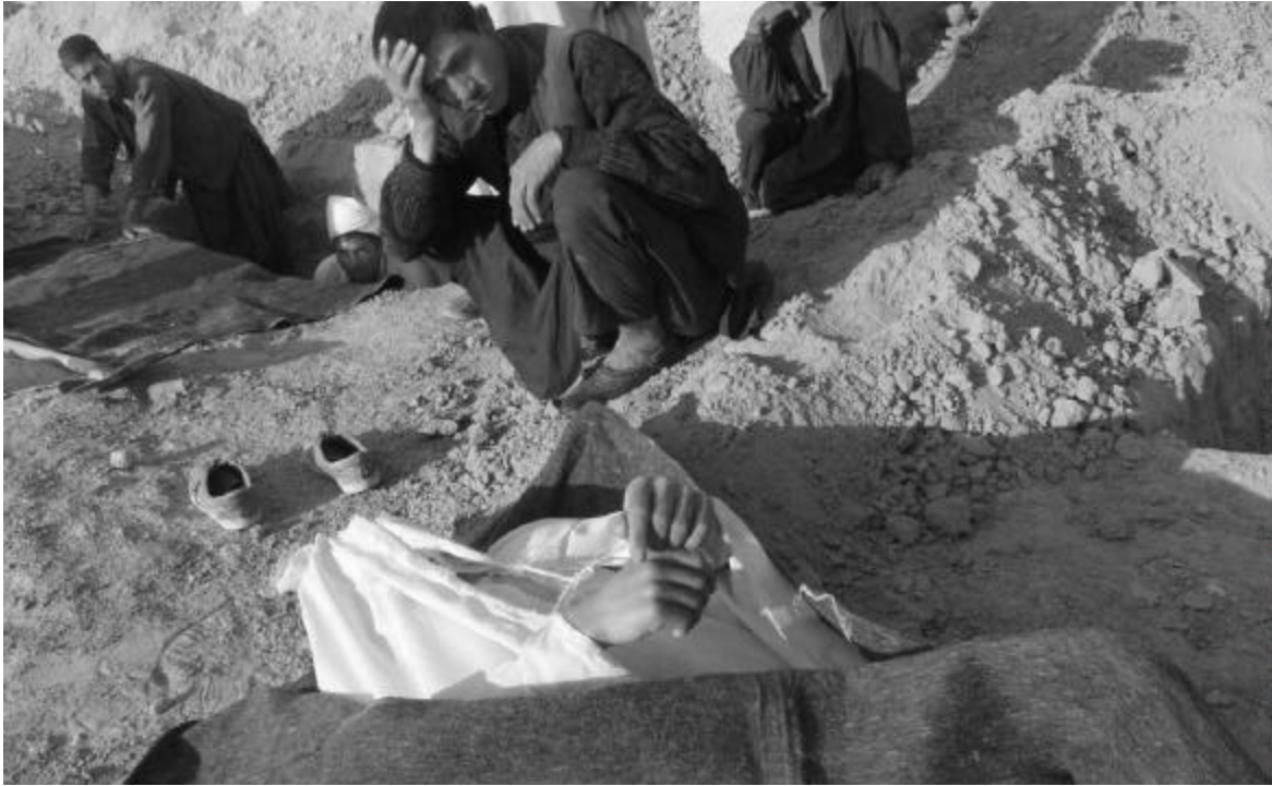
One of the bodies of a group of refugees who were killed, apparently, while attempting to cross the border to Iran. Corpses were found with their hands oddly and "inexplicably" stiffened mid-air. Zaranj. March 17, 2002.