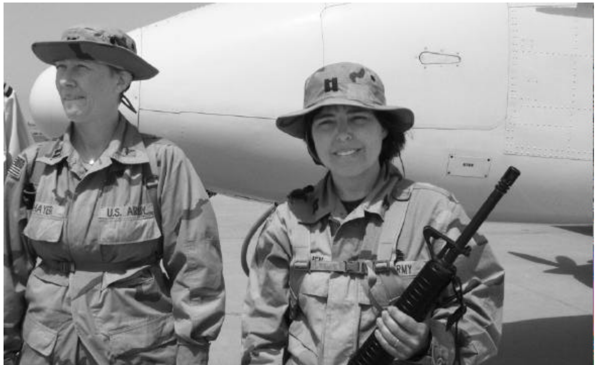
U.S. soldiers. Khandehar Airport. April, 2002.