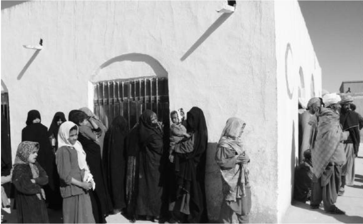
Refugees waiting outside the Médecins du Monde's clinic. Zaranj. March 13, 2002.