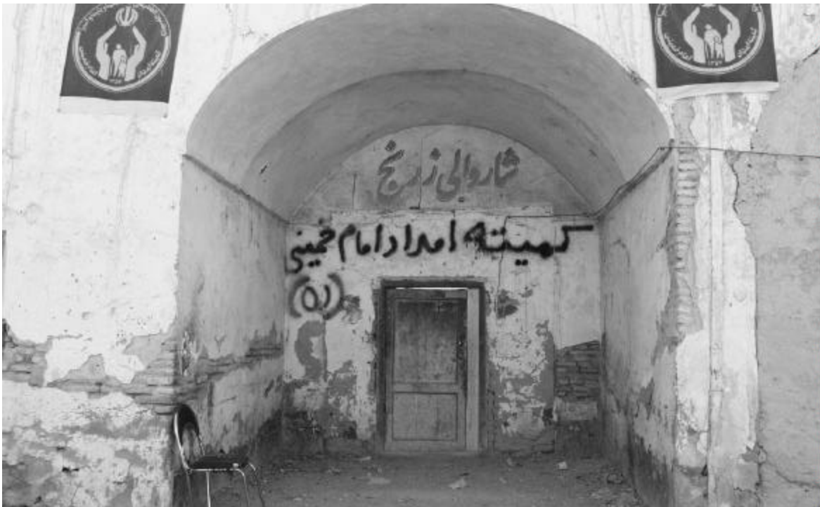
Headquarters of Komite-ye Emdad-e Imam Khomeini (Imam Khomeini's Aid Committee, funded by Iranian government). Zaranj. March, 2002.